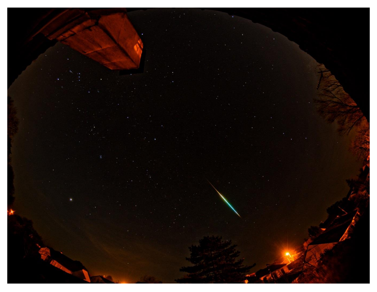
Nicolas Rossetto captured this colorful fireball on January 30, 2024, at 23:04 CET (22:04 UT ) from Jouhe, France.

During this period, the moon reaches its first quarter phase on Sunday July 14th. At that time the moon will lie 90 degrees east of the sun and will set near midnight local daylight-saving time (LDST). As the week progresses the waxing gibbous moon will set later during the morning hours, limiting the amount of time available to view under dark skies. The estimated total hourly rates for evening observers this weekend should be near 2 as seen from mid-northern latitudes (45N) and 2 as seen from tropical southern locations (25S) For morning observers, the estimated total hourly rates should be near 15 as seen from mid-northern latitudes (45N) and 12 as seen from tropical southern locations (25S). The actual rates seen will also depend on factors such as personal light and motion perception, local weather conditions, alertness, and experience in watching meteor activity. Evening rates are reduced during this period due to moonlight. Note that the hourly rates listed below are estimates as viewed from dark sky sites away from urban light sources. Observers viewing from urban areas will see less activity as only the brighter meteors will be visible from such locations.