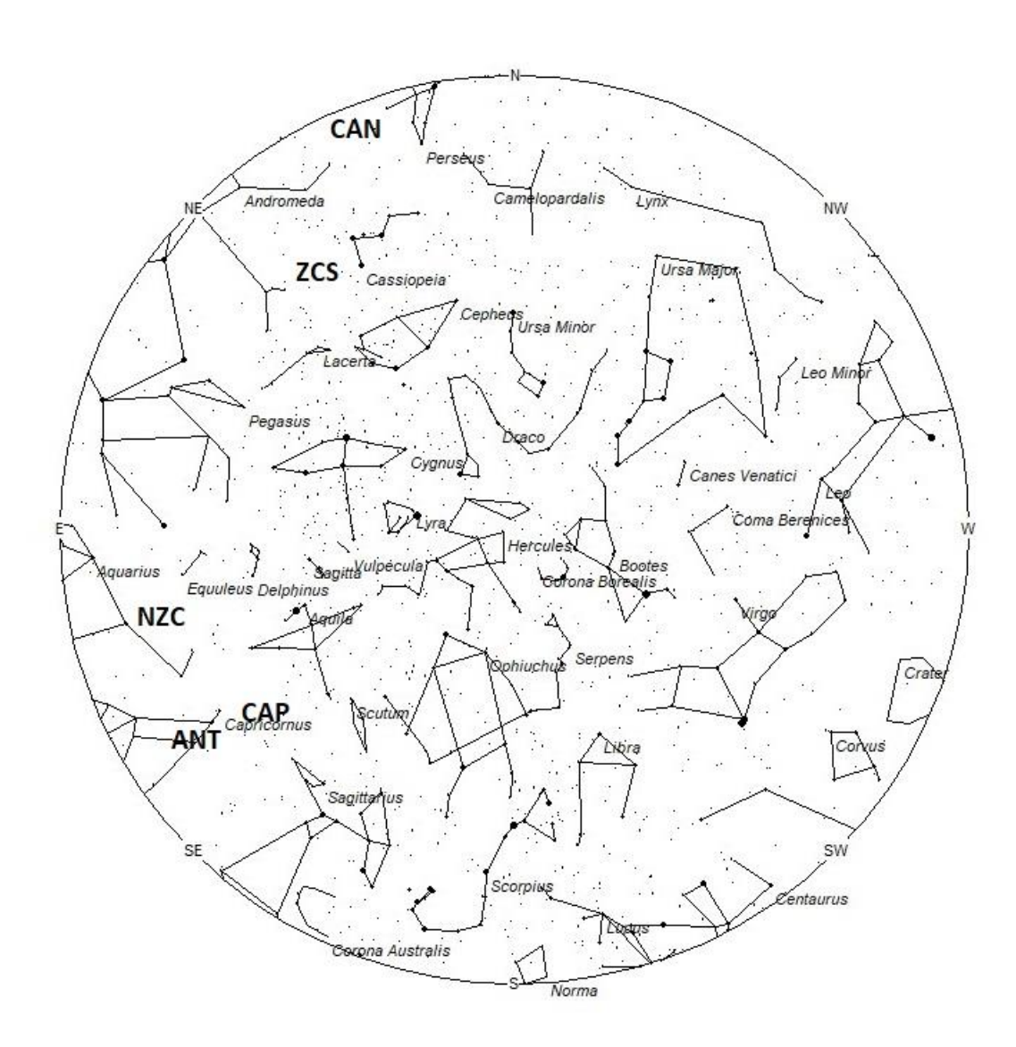
Radiant Positions at 10pm Local Daylight-Saving Time

at any time of night on any date of the year. Activity from each radiant is best seen when it is positioned highest in the sky, either due north or south along the meridian, depending on your latitude. Radiants that rise after midnight will not reach their highest point in the sky until daylight. For these radiants, it is best to view them during the last few hours before dawn. It must be remembered that meteor activity is rarely seen at its radiant position. Rather they shoot outwards from the radiant, so it is best to center your field of view so that the radiant lies toward the edge and not the center. Viewing there will allow you to easily trace the path of each meteor back to the radiant (if it is a shower member) or in another direction if it is sporadic. Meteor activity is not seen from radiants that are located far below the horizon. The positions below are listed in a west to east manner in order of right ascension (celestial longitude). The positions listed first are located further west therefore are accessible earlier in the night while those listed further down the list rise later in the night.