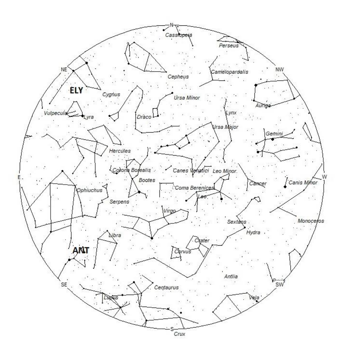
Radiant Positions at 10pm Local Daylight-Saving Time

The center of each chart is the sky directly overhead at the appropriate hour. These charts are oriented for facing south but can be used for any direction by rotating the charts to the desired direction. A planisphere or computer planetarium program is also useful in showing the sky at any time of night on any date of the year. Activity from each radiant is best seen when it is positioned highest in the sky, either due north or south along the meridian, depending on your latitude. Radiants that rise after midnight will not reach their highest point in the sky until daylight. For these radiants, it is best to view them during the last few hours before dawn. It must be remembered that meteor activity is rarely seen at its radiant position. Rather they shoot outwards from the radiant, so it is best to center your field of view so that the radiant lies toward the edge and not the center. Viewing there will allow you to easily trace the path of each meteor back to the radiant (if it is a shower member) or in another direction if it is sporadic. Meteor activity is not seen from radiants that are located far below the horizon. The positions below are listed in a west to east manner in order of right ascension (celestial longitude). The positions listed first are located further west therefore are accessible earlier in the night while those listed further down the list rise later in the night.