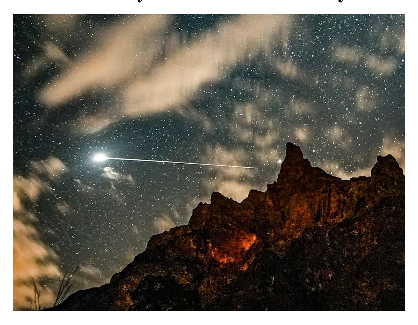
William Klock captured this brilliant fireball through clouds on August 12, 2023, at 04:04 CET (02:04 UT) from Sixt-Fer-à-Cheval, France.

During this period, the moon reaches its first quarter phase on Wednesday May 15th. At that time, the moon will be located 90 degrees east of the sun and will set near 02:00 local daylight saving time (LDST). This weekend the waxing crescent moon will set near 01:00 Sunday morning but will offer little interference as long as you keep it out of your field of view. The estimated total hourly rates for evening observers this weekend should be near 2 as seen from midnorthern latitudes (45N) and 3 as seen from tropical southern locations (25S). For morning observers, the estimated total hourly rates should be near 10 as seen from mid-northern latitudes (45N) and 17 as seen from tropical southern locations (25S). Evening rates are slightly reduced due to moonlight. The actual rates seen will also depend on factors such as personal light and motion perception, local weather conditions, alertness, and experience in watching meteor activity. Note that the hourly rates listed below are estimates as viewed from dark sky sites away from urban light sources. Observers viewing from urban areas will see less activity as only the brighter meteors will be visible from such locations.