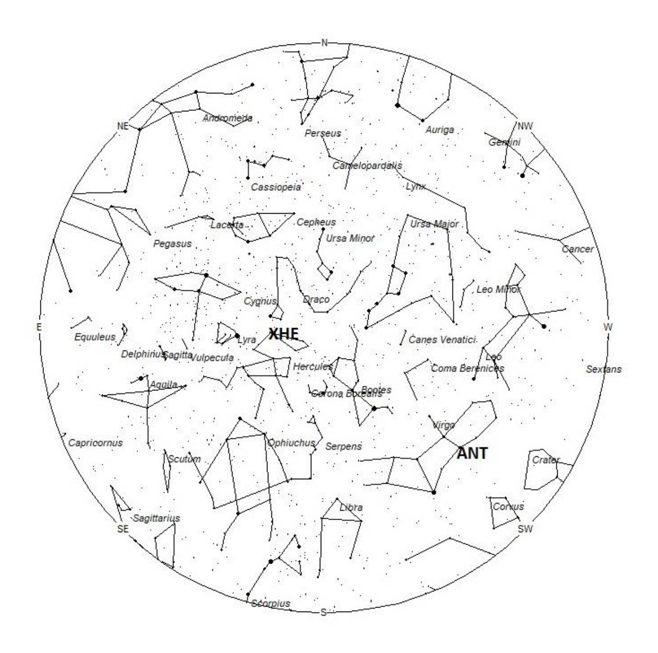
Radiant Positions at 05:00 Local Daylight-Saving Time