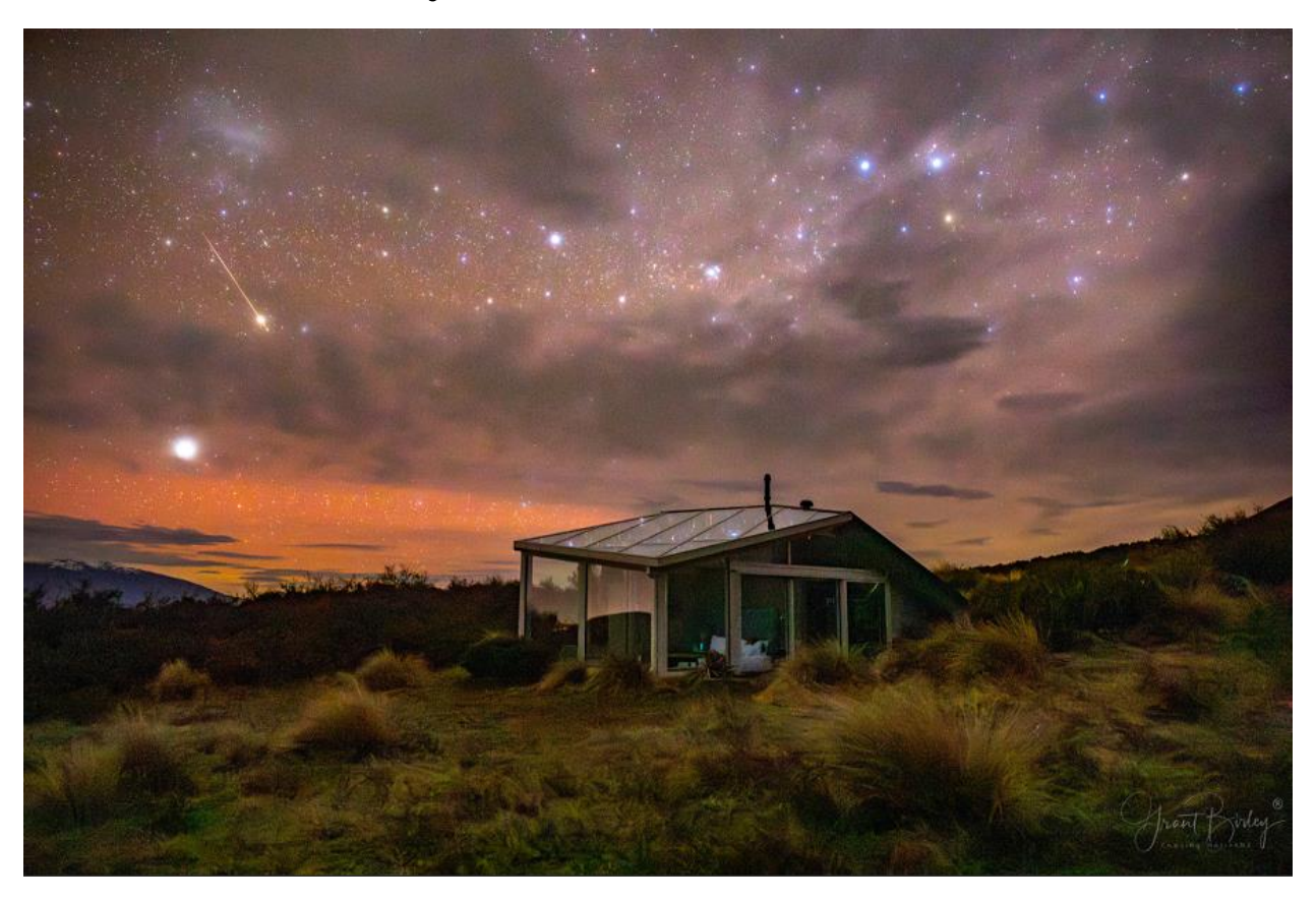
Grant Birley captured this colorful fireball through clouds on August 14, 2023, at 21:07 NZDT (09:07 UT) from Ben Ohau, New Zealand. Notice the Southern Cross lying on its side in the upper right-hand corner above the structure.

During this period, the moon reaches its first quarter phase on Sunday March 17th. At that time, the moon will be located 90 degrees east of the sun and will be set near 03:00 Local Daylight-Saving Time (LDST). As the week progresses the waxing gibbous moon will encroach upon the more active late morning hours, reducing the number of meteors to be seen. The estimated total hourly rates for evening observers this weekend should be near 2 as seen from mid-northern latitudes (45N) and 3 as seen from tropical southern locations (25S) For morning observers, the estimated total hourly rates should be near 6 as seen from mid-northern latitudes (45N) and 9 as seen from tropical southern locations (25S). The actual rates seen will also depend on factors such as personal light and motion perception, local weather conditions, alertness, and experience in watching meteor activity. Rates are reduced during this period due to moonlight. Note that the hourly rates listed below are estimates as viewed from dark sky sites away from urban light sources. Observers viewing from urban areas will see less activity as only the brighter meteors will be visible from such locations.