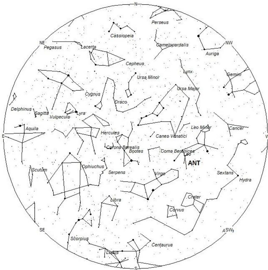
Radiant Positions at 4:00am Local Standard Time