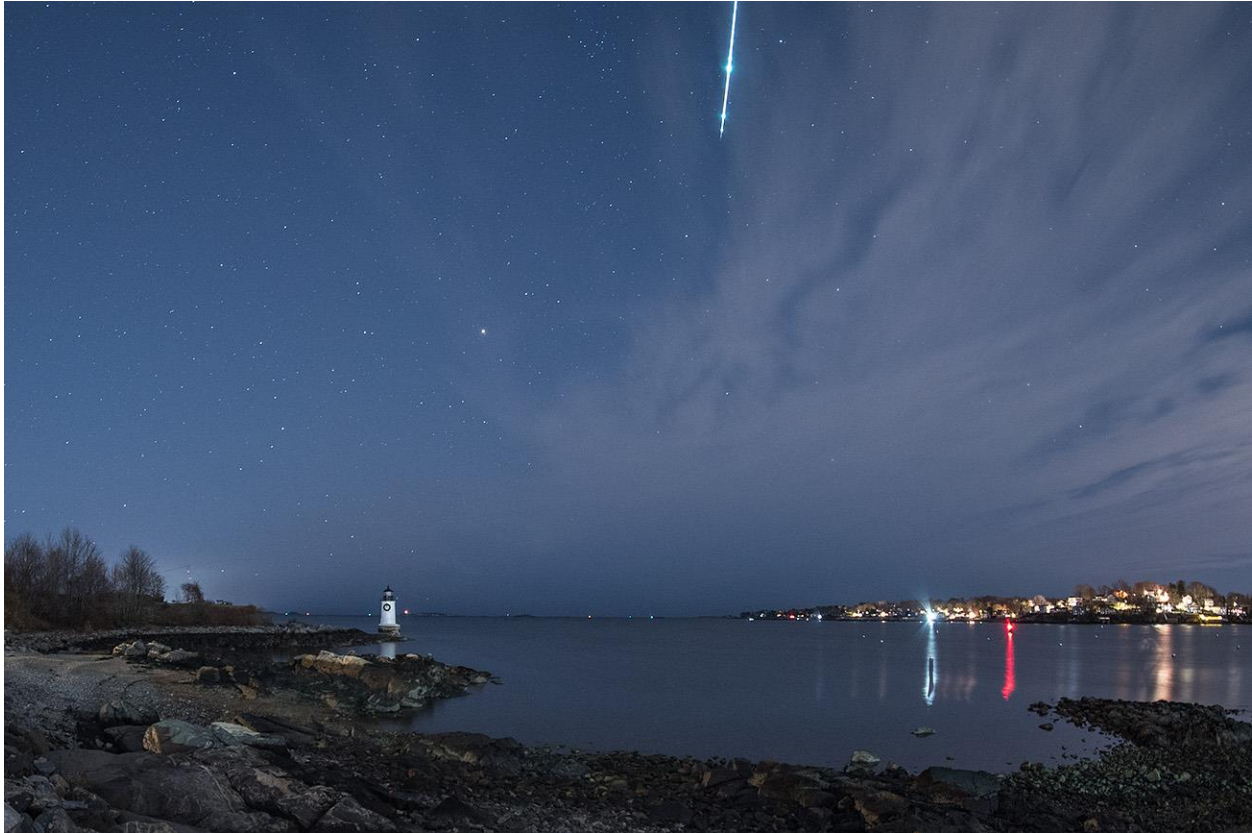
Rick Matthias captured this double bursting fireball on December 14, 2021 at 3:38 EST (8:38 UT) from Salem, Massachusetts, USA. This was most likely a member of the Geminid meteor shower, which peaked in intensity that morning.

During this period, the moon reaches its last quarter phase on Wednesday February 23rd. At that time the moon lies 90 degrees west of the sun and rises near 01:00 local standard time (LST). This weekend the waning gibbous moon will rise during the evening hours and will spoil the sky for meteor viewing the remainder of the night. The estimated total hourly meteor rates for evening observers this week is near 2 no matter your location. For morning observers, the estimated total hourly rates should be near 3 as seen from mid-northern latitudes (45N) and 6 as seen from tropical southern locations (25S). The actual rates will also depend on factors such as personal light and motion perception, local weather conditions, alertness, and experience in watching meteor activity. Rates during this period are reduced due to strong moonlight. Note that the hourly rates listed below are estimates as viewed from dark sky sites away from urban light sources. Observers viewing from urban areas will see less activity as only the brighter meteors will be visible from such locations.