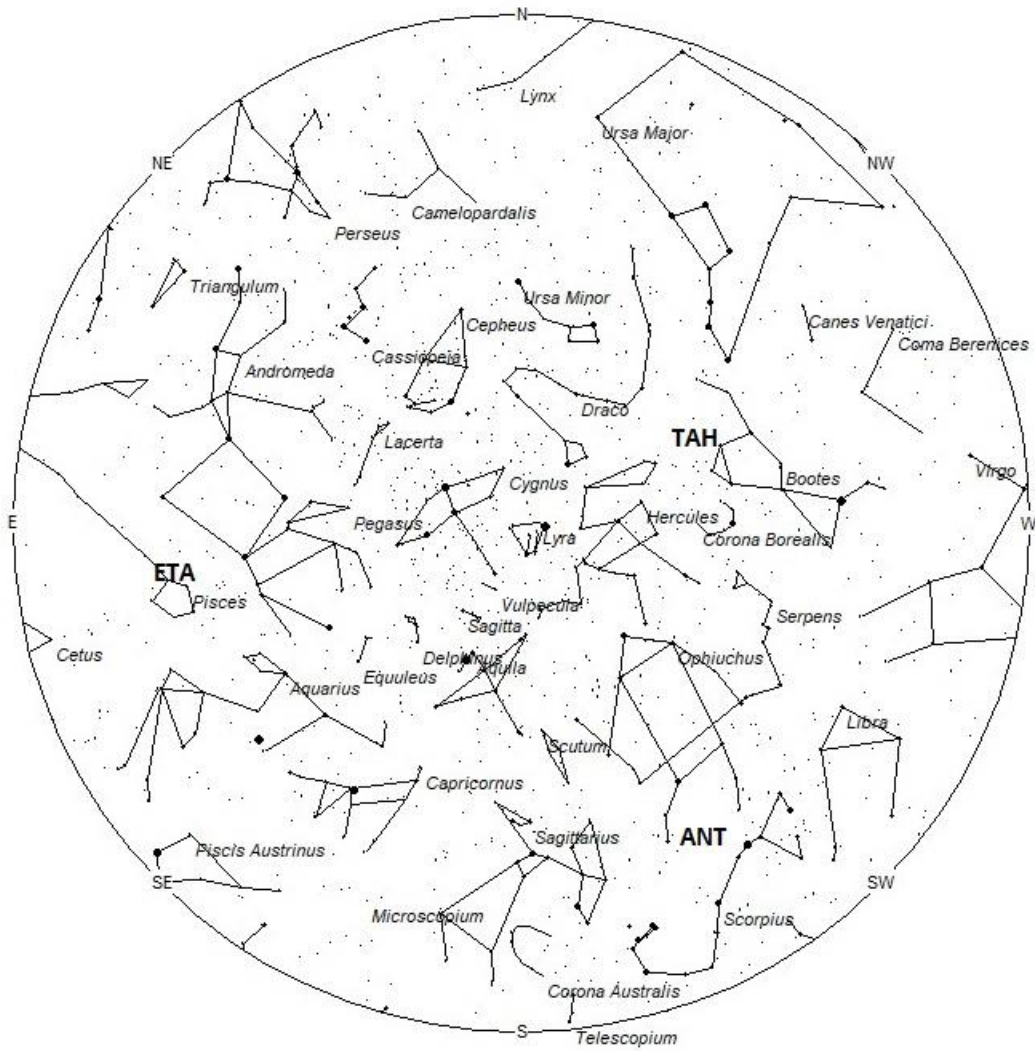
Radiant Positions at 4am Local Daylight Saving Time