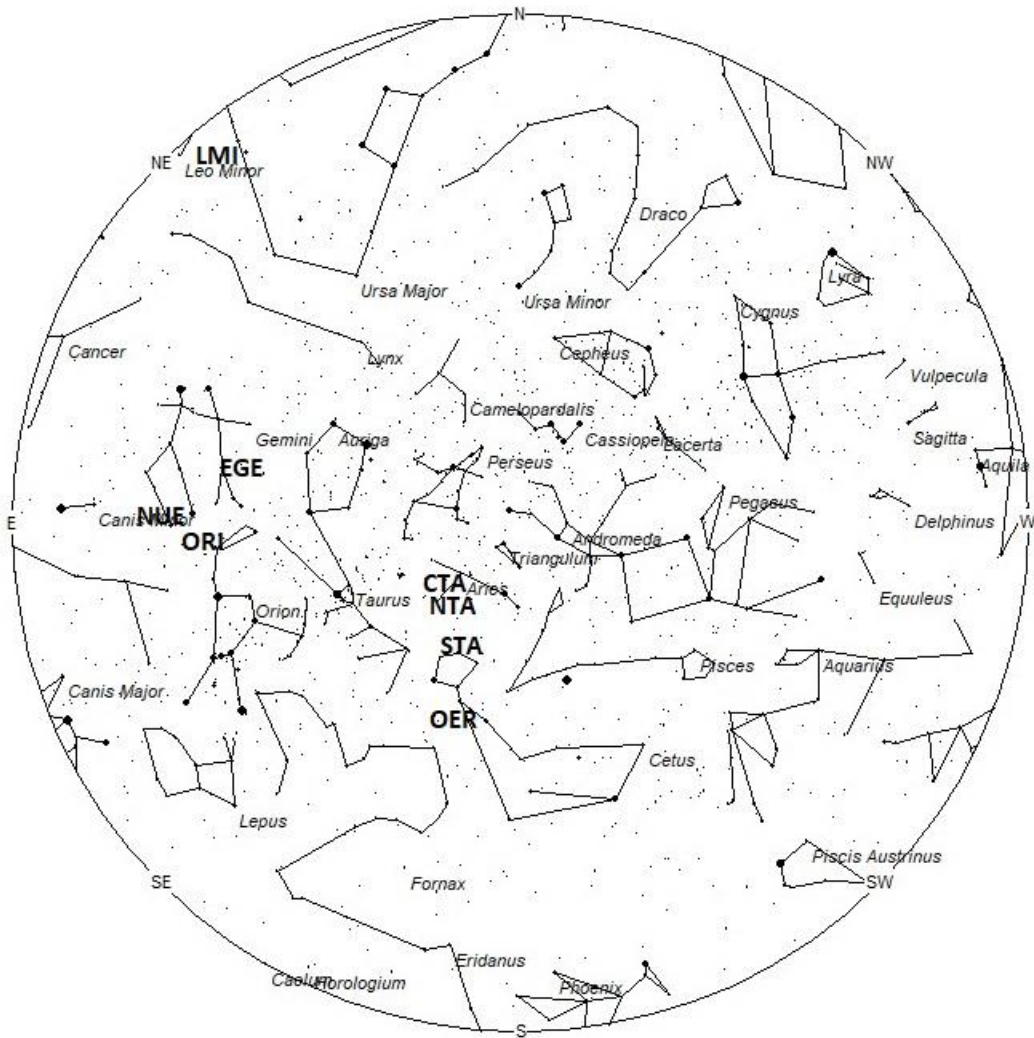
Radiant Positions at 1am Local Daylight Saving Time