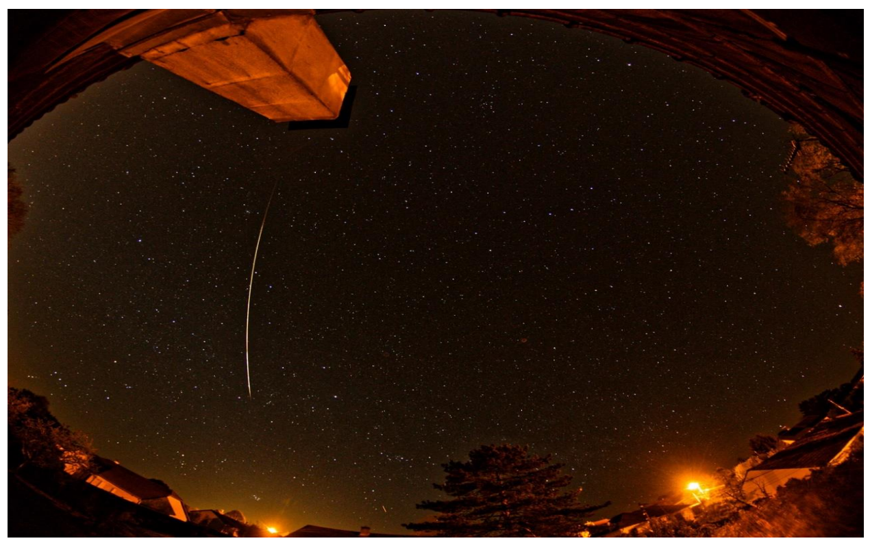
Nicolas Rossetto captured this meteor shooting through the constellation of Gemini on April 10, 2024, at 23:01 CEST (21:01 UT) from Jouhe, France.

Meteor activity increases in October when compared to September. A major shower (the Orionids) is active all month long and there are also many minor showers to be seen. Both branches of the Taurids become more active as the month progresses, providing slow, graceful meteors to the nighttime scene. The Orionids are the big story of the month reaching maximum activity on the 21st. This display can be seen equally well from both hemispheres, which definitely helps out observers located in the sporadic-poor southern hemisphere this time of year. Sporadic activity is still good as seen from the northern hemisphere. In the southern hemisphere though, the sporadic activity is near its annual nadir.