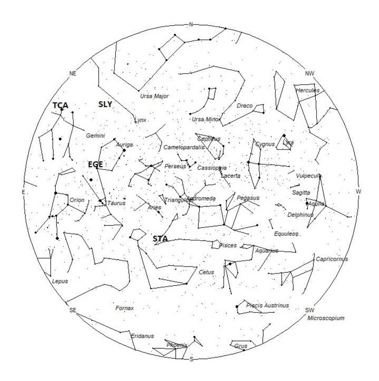
Radiant Positions at 01:00 Local Daylight-Saving Time