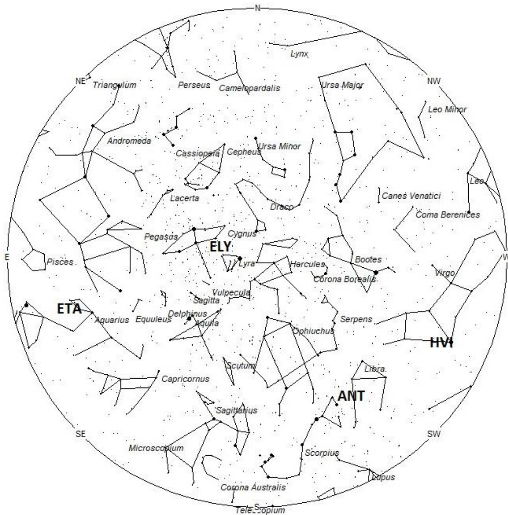
Radiant Positions at 4am Local Daylight-Saving Time